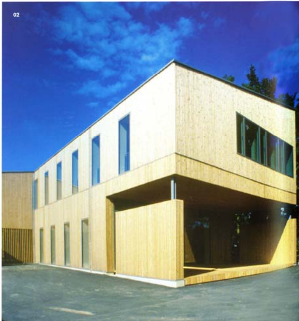
01 West and north elevation 02 Exterior view 03 Recreation court 04 Larchwood canopy above classroom courtyard

This school, which accommodates 100 mentally disabled children and 40 teachers, was designed as a patchwork of different components and forms. The result is an ensemble of attractive spaces and rooms. The distinguishing feature of this structure is the use of nail-laminated timber elements. The architects describe this as "a consistent texture that add a large measure of sensual stimulation to the building. The tectonics of the layered boards symbolize the effort to strengthen and support the individual pupil while maintaining a solidly united school community." This is a building that is best experienced with the senses; in addition to its changing moods of light and shadow, it can be felt, heard, smelt and – as resins bleed from the wood – even tasted. Wood features here in a wide variety of forms: in durable, white-pigmented, oiled spruce walls; in sturdy doors; in the floors of the upper level, in handrails and coatracks of fumed oak; and in the larchwood canopy above the classroom courtyard.