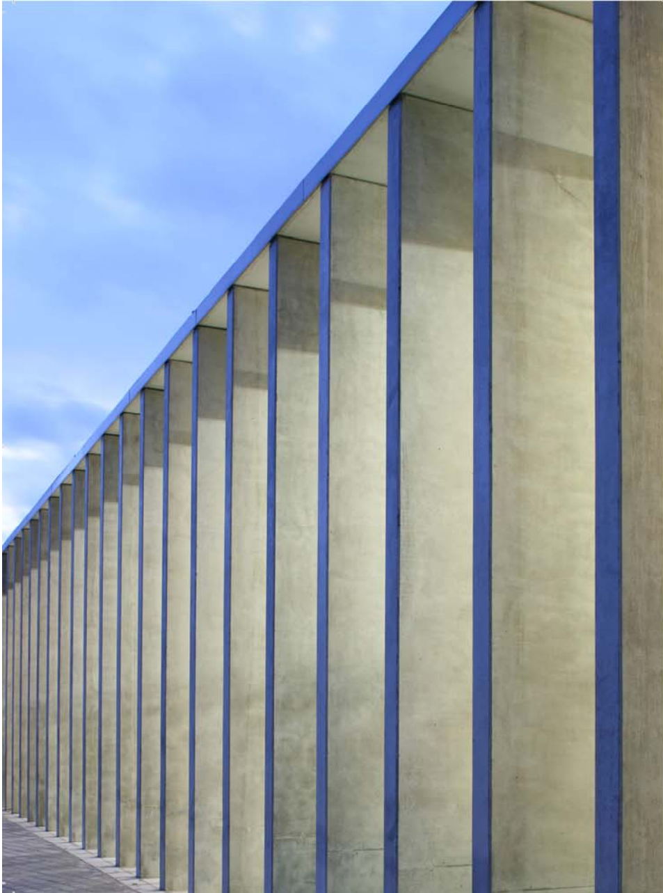
DESPANG ARCHITEKTEN | HANNOVER, MUNICH, LINCOLN school cafeteria Groß-Ilse, Germany | 2008 Material exposed prefab concrete