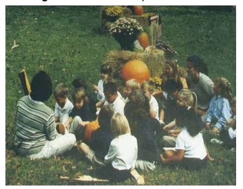
kinder- garden as the ideal space