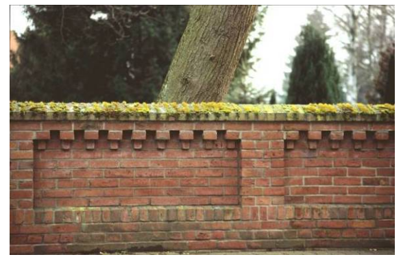
building as simple as the enclosure of the garden