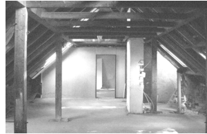
found inspirational textures