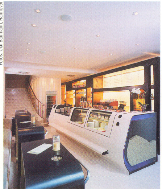
Kreipe's Coffee Time, Rathenastr. 12, Hannover Design: Despang Architekten, Hannover

Whoever approached the World Exhibition site during the World Exhibition duration by tram, knows the tram stations by Despang Architekten . Whoever likes to enjoy a nice cup of coffee in a well designed environment in Hannover, gets to know the Kreipe's Coffee Time: Instead of traditional furnishings the fitments, such as bars and benches, are developed from the light-beige vinyl used as flooring and wall cladding, thereby supporting the linear spatial impression of the elongated, narrow ground floor.