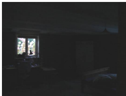
given originally activity /